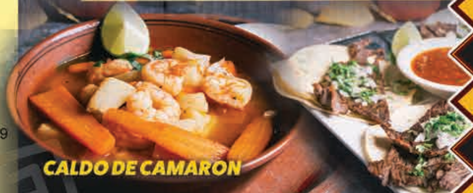
CALDO DE CAMARON