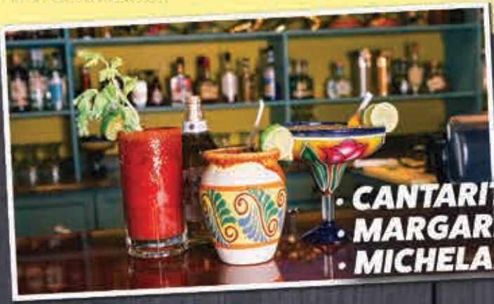
• CANTARITOS • MARGARITAS • MICHELADAS