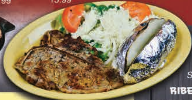
STEAK SANTA FE